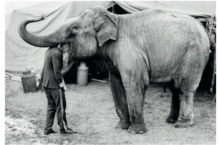
Right: a trainer puts faith in his elephant's appetite at Circus Hoffman, Weymouth, 1974