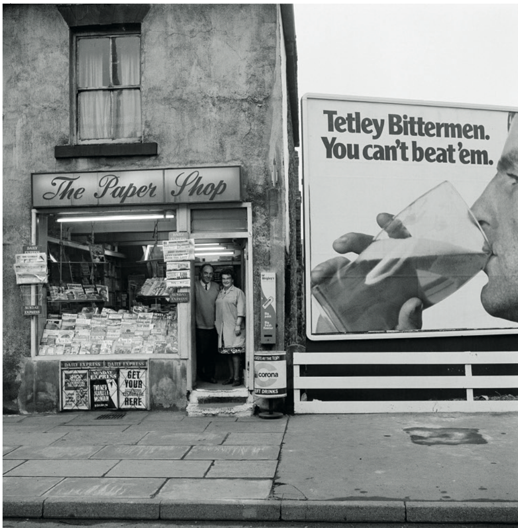
Left: a newsagent vies for attention beside a hoarding in Attercliffe, Sheffield, 1973