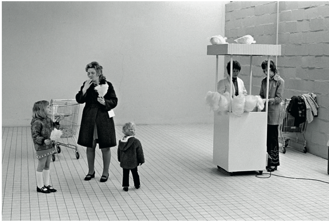
Above: a family enjoy candyfloss at the opening of a hypermarket in Telford New Town, Shropshire, 1974